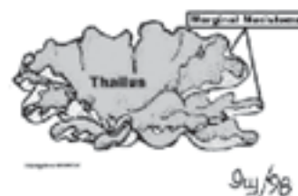
Fig. 2: Schematic of Anthoceros sp. thallus

Dr. Ann I. King UC Cooperative Extension 625 Miramontes, Suite 200 Half Moon Bay, CA 94019 Phone: (650) 726-9059 Fax: (650) 726-9267 e-mail: aiking@ucdavis.edu