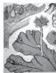
Fig. 1: Marchantia sp. (liverwort)

Information from: (1) Integrated Pest Management for Floriculture and Nurseries (UC DANR publication #3402); (2) Forest Nursery Notes ( www.forestry.auburn.edu/sfnmc/class/fy614cryptogams.html ); (3) illus. #1 from www.bio.umass.edu/biology/conn.river/liverwts.html ; (4) illus. #2 from www.botany.hawaii.edu/faculty/webb/BOT311/CellTissOrgan/ThalloseLiverworts.htm